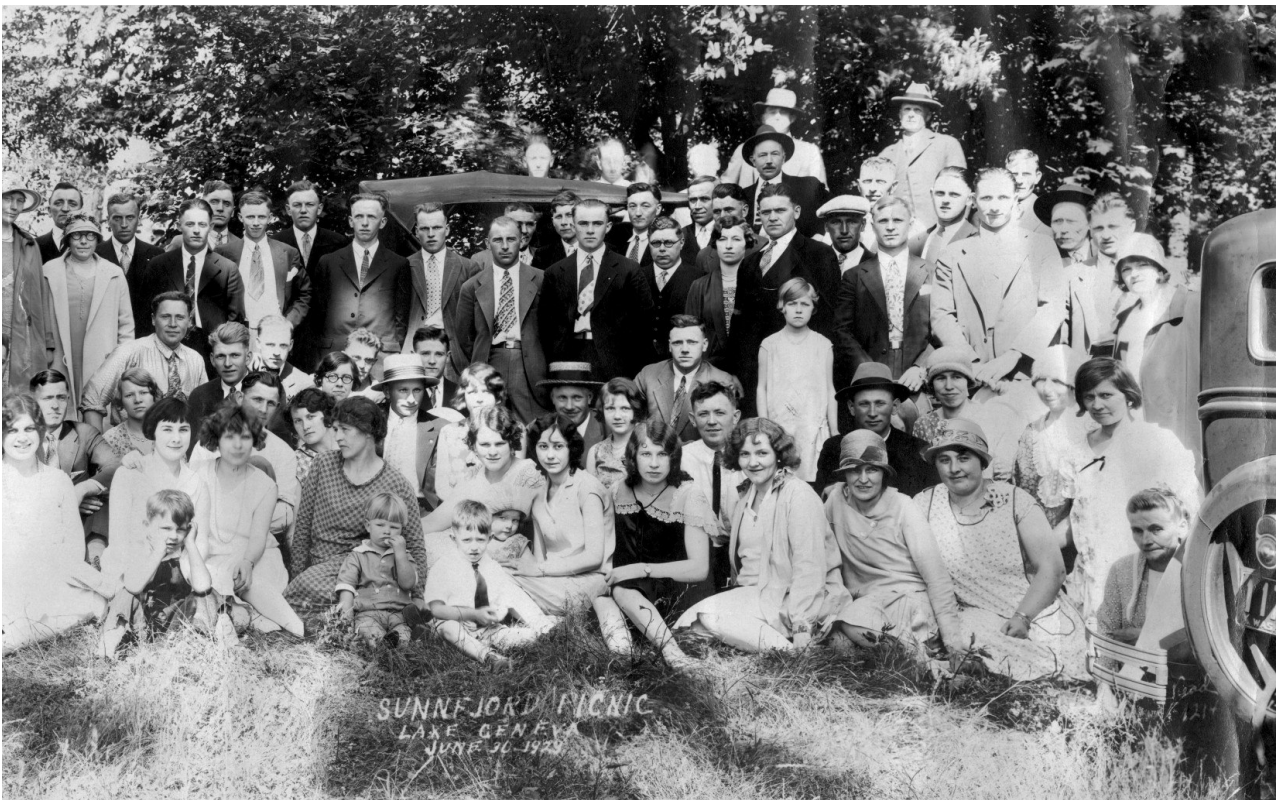
Sunnfjord-Picnic at Lake Geneve 30 June 1929